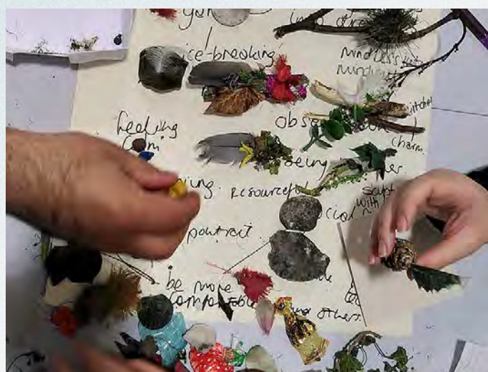
The Treaty of Finsbury Park 2025 Furtherfield featuring Cade Diehm