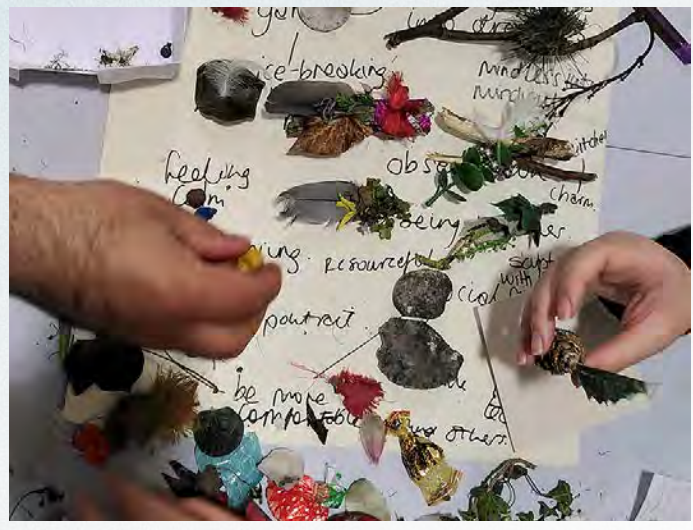
The Treaty of Finsbury Park 2025 Furtherfield featuring Cade Diehm